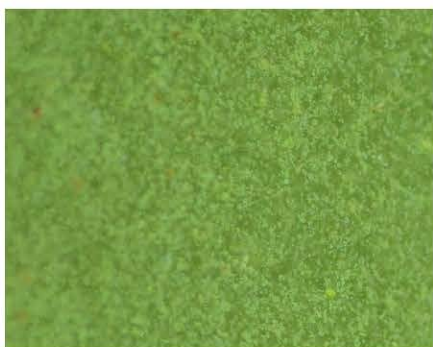
Has small green dots floating in it