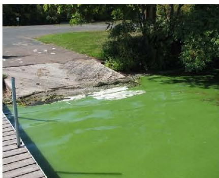
Looks like green pea soup