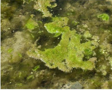
True algae (green algae)

Blooms have look-alikes! These conditions do not produce toxins and are NOT harmful: