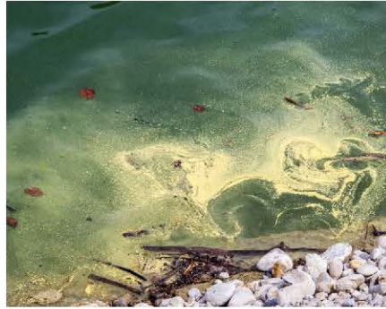
Yellow plant pollen