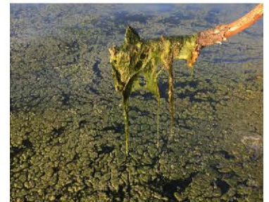
Green algae are not harmful.

*These tests may help you determine if you have higher levels of blue-green in your lake, but they don't tell you whether or not the blue-green algae are actually producing toxins. When in doubt, it's best to keep out!