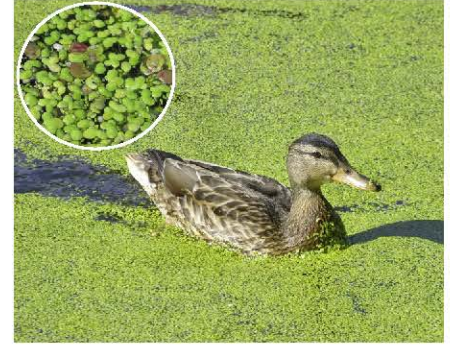
Tiny aquatic plants (duckweed)

To determine whether what you're seeing are true algae or blue-green algae, you can conduct the jar or stick test. Remember to wear rubber or latex gloves for protection!