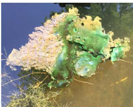
Has floating scum, globs, or mats