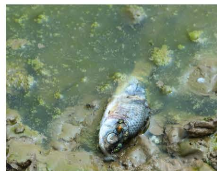
Has dead fish or other animals